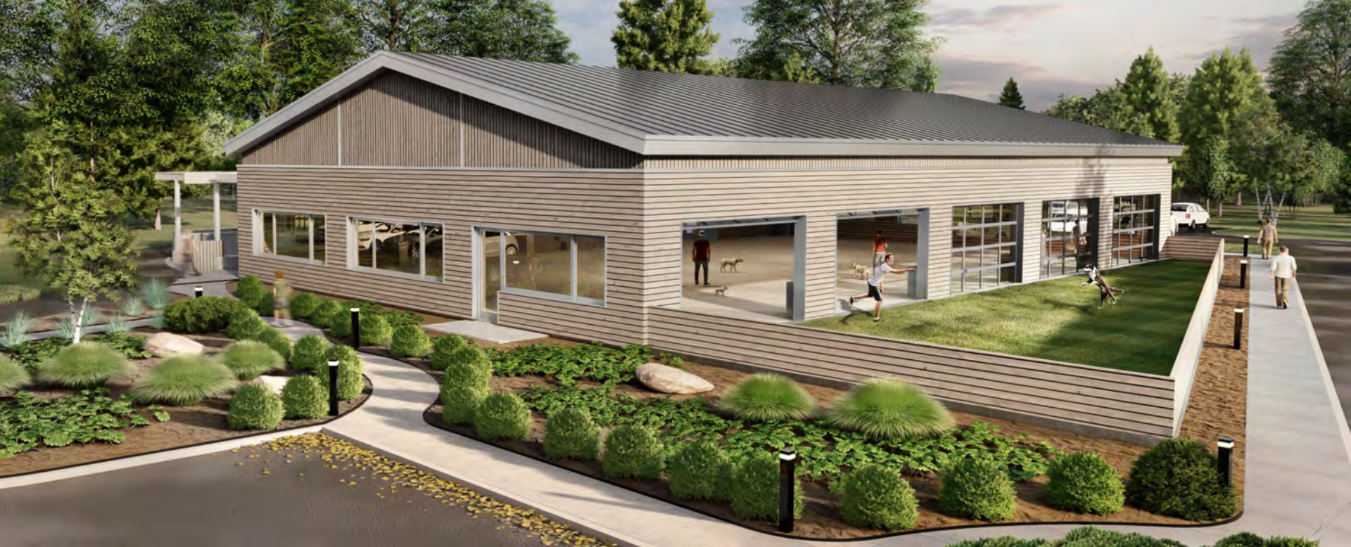
Renderings of the new William P. Rayner Training Center courtesy of project architects Bacon Group, Inc.