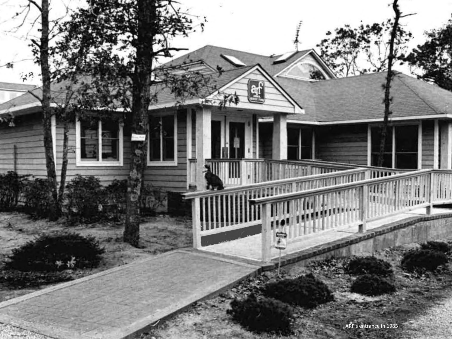
ARF's entrance in 1985