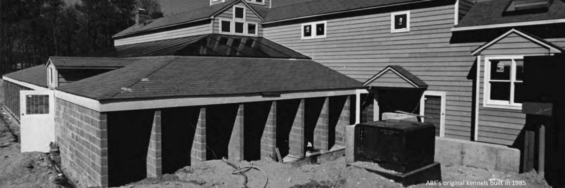
ARF's original kennels built in 1985