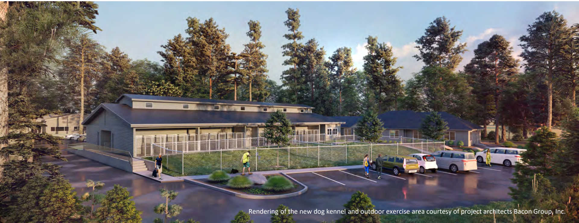
Rendering of the new dog kennel and outdoor exercise area courtesy of project architects Bacon Group, Inc.

This naming opportunity is still available. Please contact scott@arfhamptons.org to learn more.