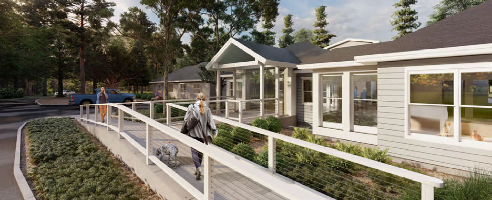
Renderings of the new Richard Wells McCabe Welcome Center courtesy of project architects Bacon Group, Inc.