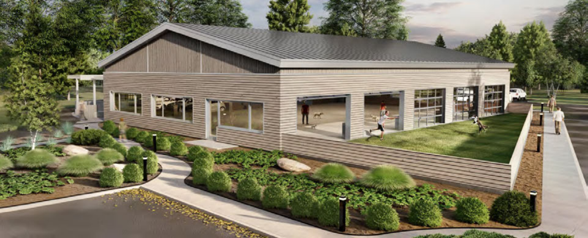
Renderings of the new William P. Rayner Training Center courtesy of project architects Bacon Group, Inc.