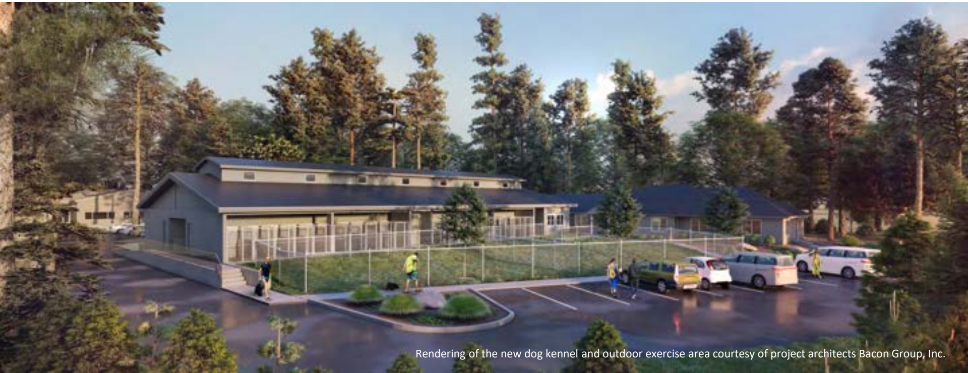
Rendering of the new dog kennel and outdoor exercise area courtesy of project architects Bacon Group, Inc.

This naming opportunity is still available. Please contact scott@arfhamptons.org to learn more.