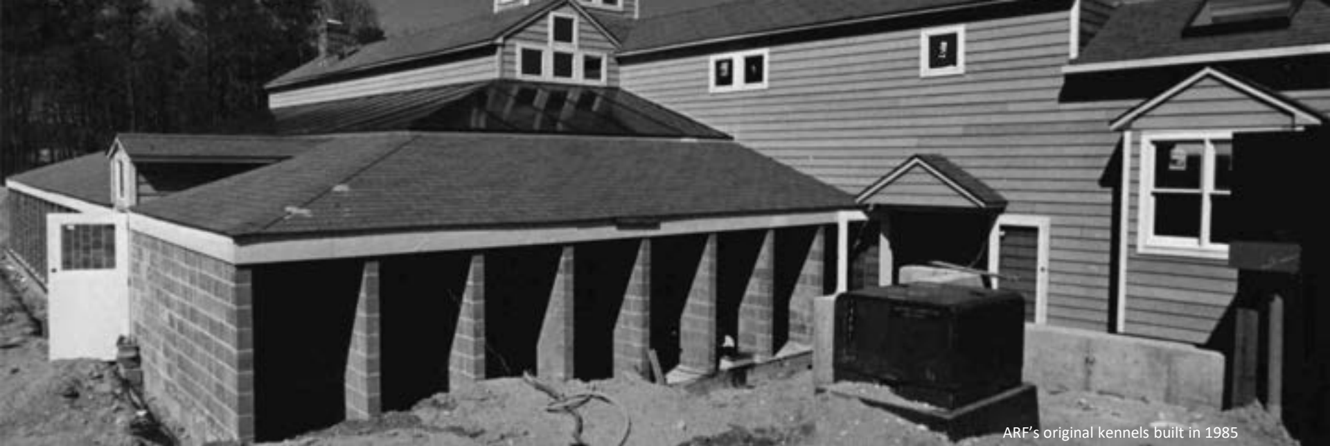
ARF's original kennels built in 1985