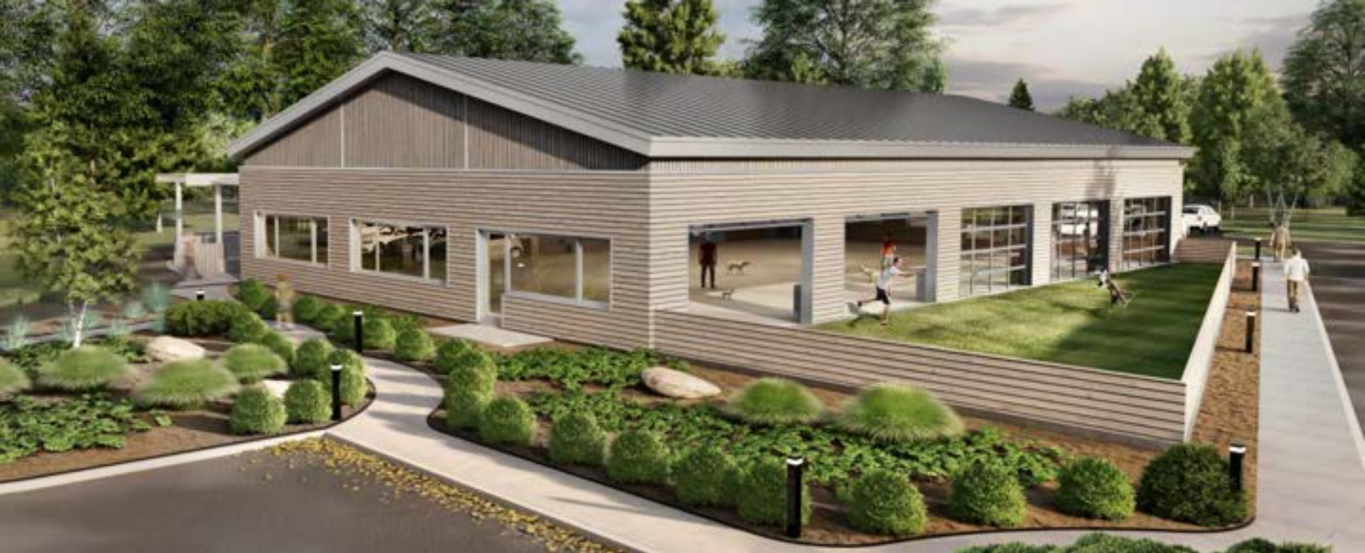
Renderings of the new William P. Rayner Training Center