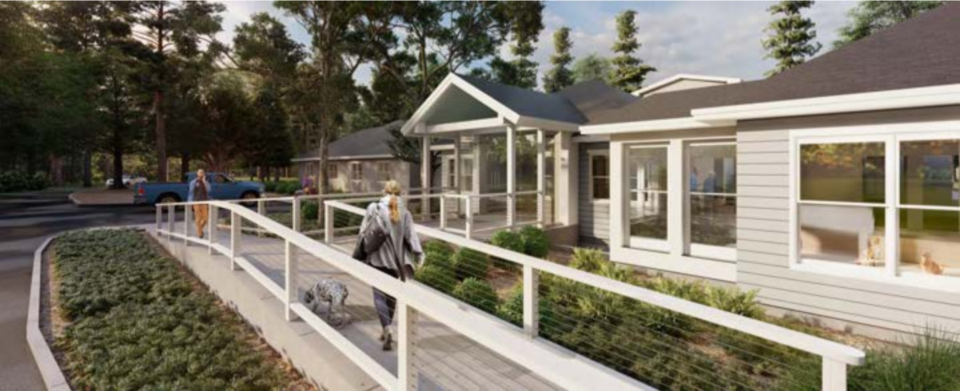
Renderings of the new Richard Wells McCabe Welcome Center courtesy of project architects Bacon Group, Inc.